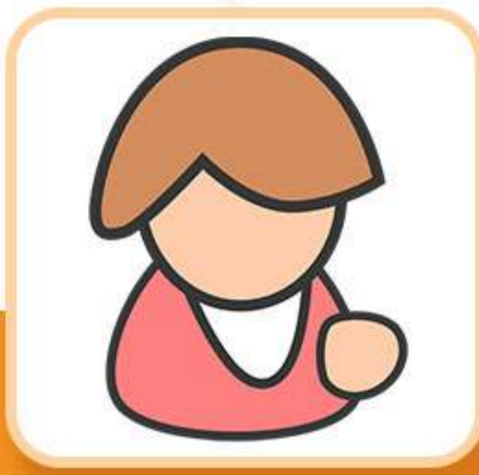
JAIMIN PRAJAPATI SOFTWARE TESTING