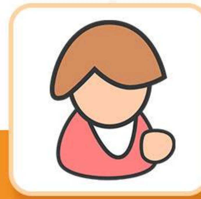
KARTIK SINGH SOFTWARE TESTING