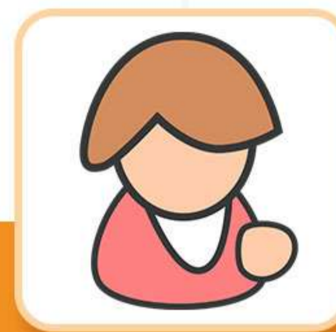
UTSAV RAMI SOFTWARE TESTING

They teach with full individual attention for every student. They are very polite and friendly nature. I'm getting real-world exposure in Software testing through the live projects. Happy to be here.